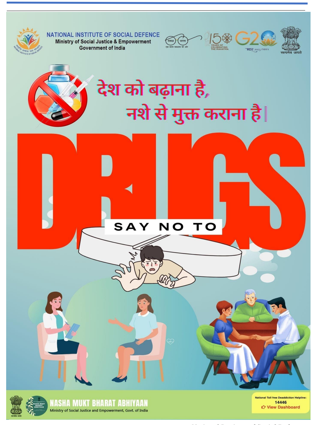
National Institute of Social Defence