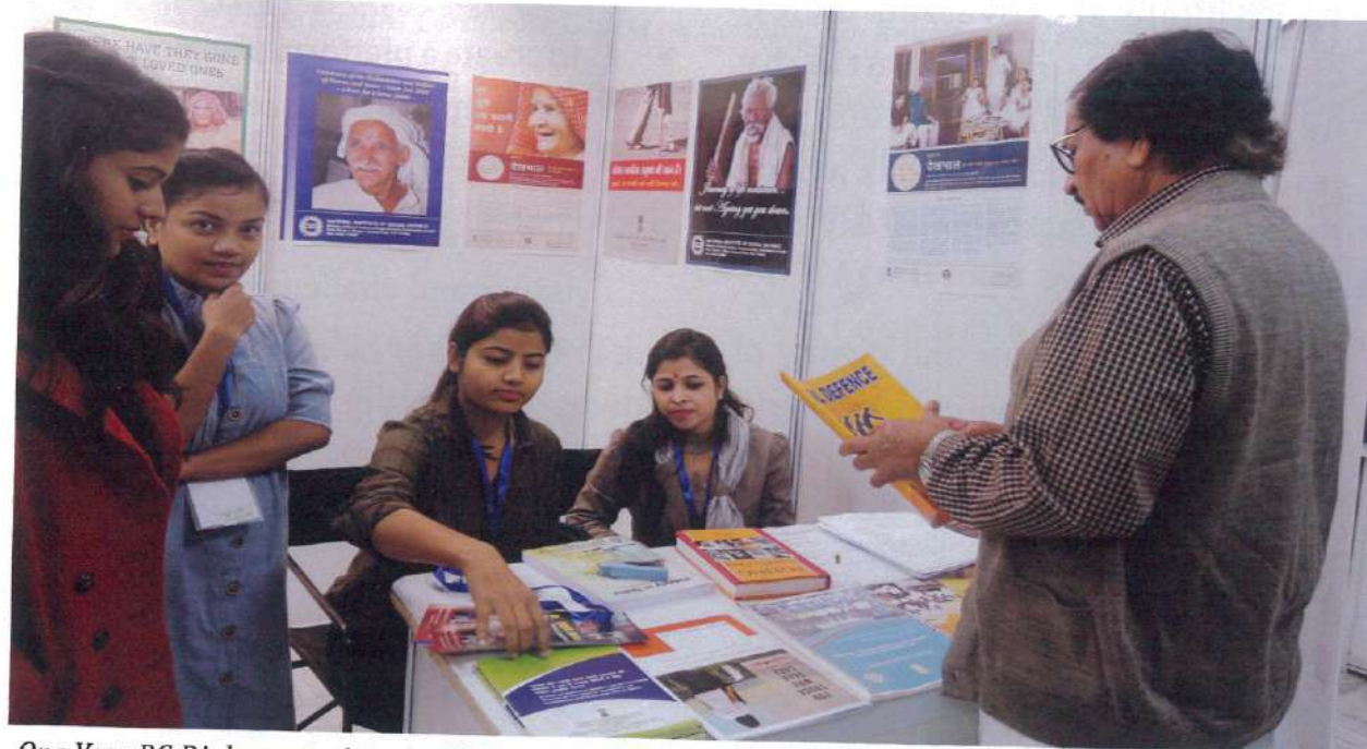
One Year PG Diploma students explaining to the delegate about NISD at NISD staff in AIIMS during 2 days International Conference on Geriatrics and Gerontological Issues on 15th & 16th November, 2018.

problems and challenges of elderly, to review disciplinary and practice base knowledge in geriatrics & gerontology and to review the social security and health measures of the senior citizens through this three days of the 4th International Congress on Gerontology and Geriatric Medicine/Asia Pacific Medicine Network Conference 2018.