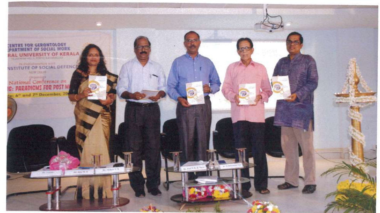
Two Days National Conference on Active Ageing organized from 6th to 7th December, 2018 in association with Central University of Kerala.