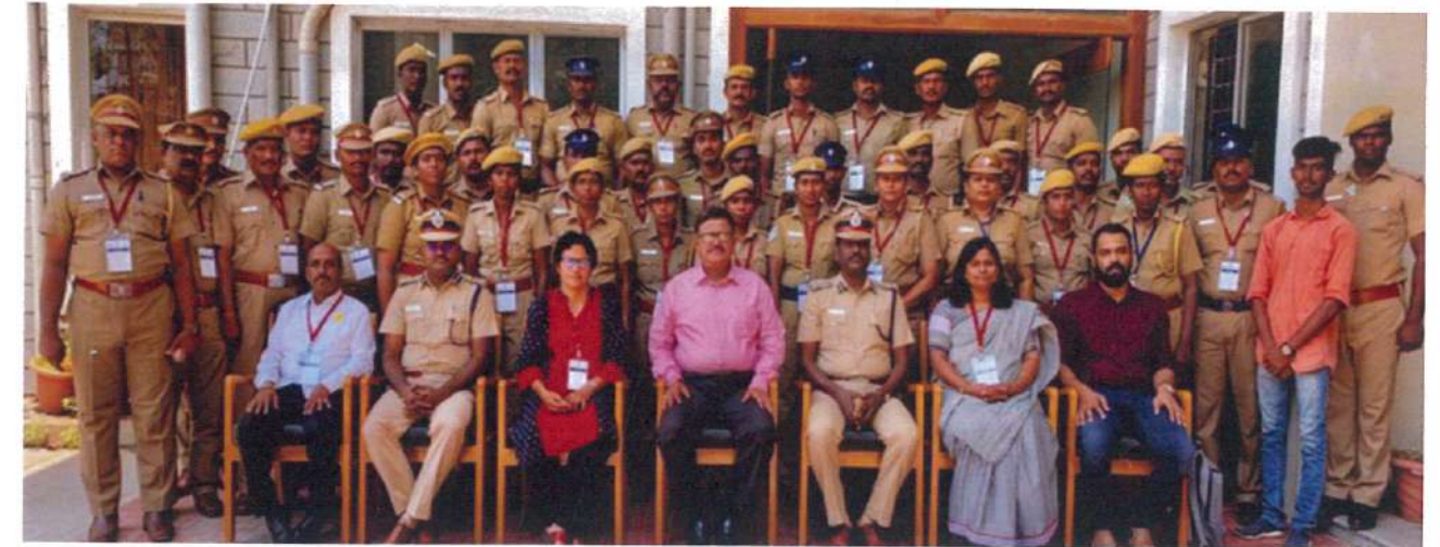
Group Photo of the three Day Training Program against Drug Abuse for Prison Functionaries held at APCA, Vellore, Tamil Nadu

understanding of the different provisions of laws and programmes, and their responsibilities in the Drug Abuse Prevention.