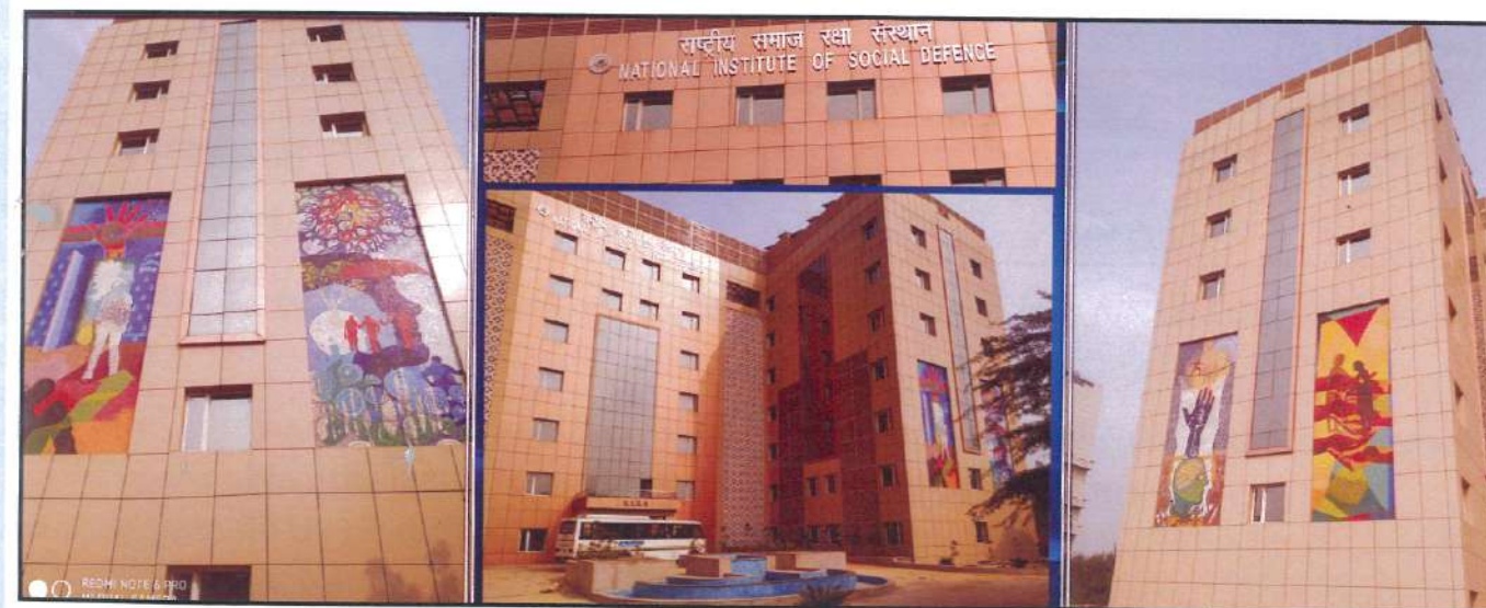
National Institute of Social Defence New Building at Plot No. 2, Sector-10, Dwarka, New Delhi

story building and Rs. 1.52 crore for installation of furniture. The Institute, up to 31/03/2019, has deposited an amount of Rs. 64.48 crores with the CPWD, for construction of Building and Rs. 1.52 crores for installation of furniture. The increase of Rs. 2.07 crore over and above the cost estimate of Rs. 62.41 crore is for the reason that, as projected by CPWD, there was cost escalation on certain items and some other development works were not anticipated /projected initially. The construction work has been completed. CPWD, will hand over the building after seeking all clearances from concerned agencies.