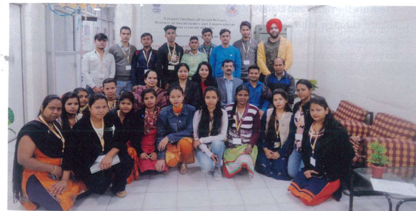
Group Photo of students of Three Months Certificate Course

During the year 2018-19, 278 students had undergone geriatric care givers course. No course fee was charged from the students.