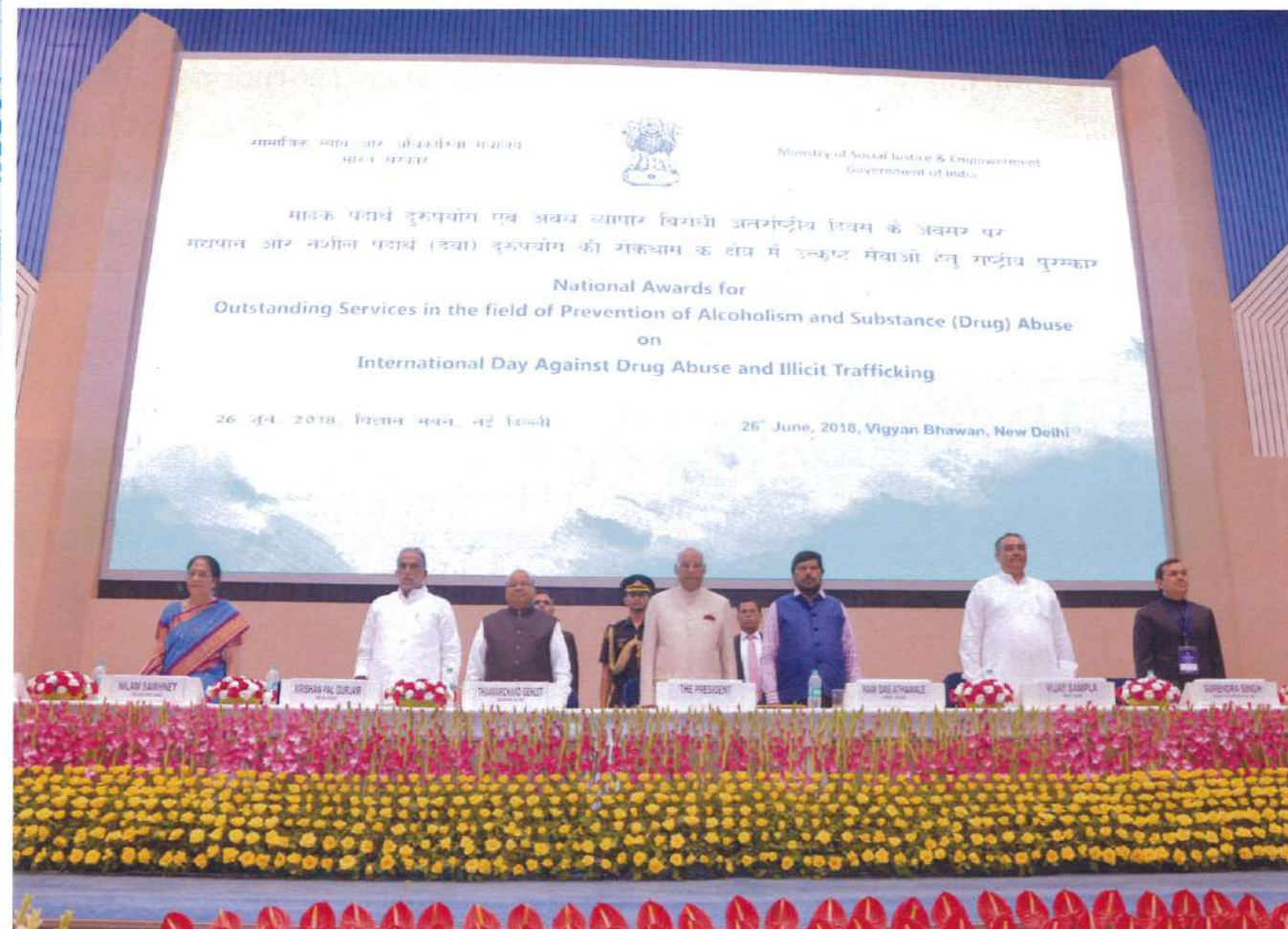
Hon'ble President of India, Shri Ram Nath Kovind along with the Minister of Social Justice and Empowerment on the observance of "The International Day against Substance Abuse and Illicit Trafficking" and National Award Function for Outstanding Services for Prevention of Alcoholism and Substance (Drug) Abuse on 26th June 2018 at Vigyan bhawan.