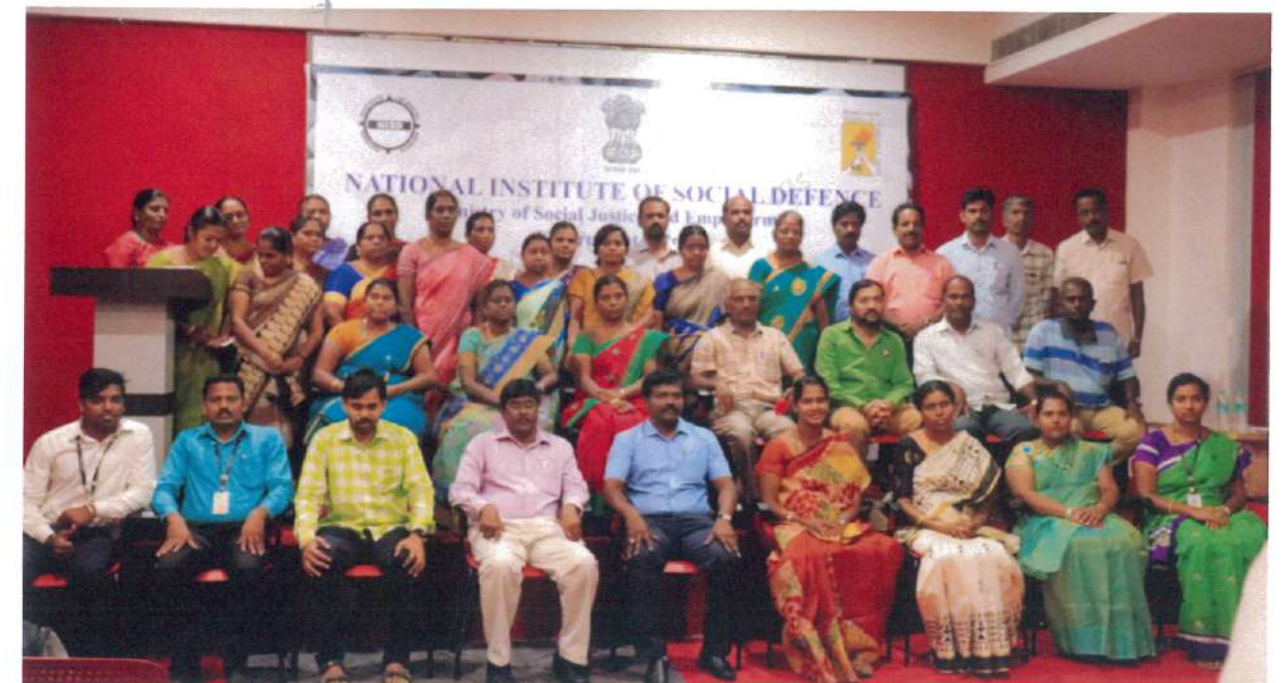
Group Photo of Three Days Programme on Specialized Care for Children Affected by Drug Abuse for School Teachers and Counsellors held from 18th-20th Sept 2019 at Hindusthan College of Arts and Science, Coimbatore.

regarding the special services for children affected by drug abuse and trains them to provide special skills required for rehabilitation of such children.