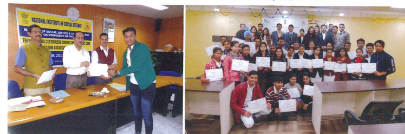
Certificate distribution to the students of Three Months Certificate Course