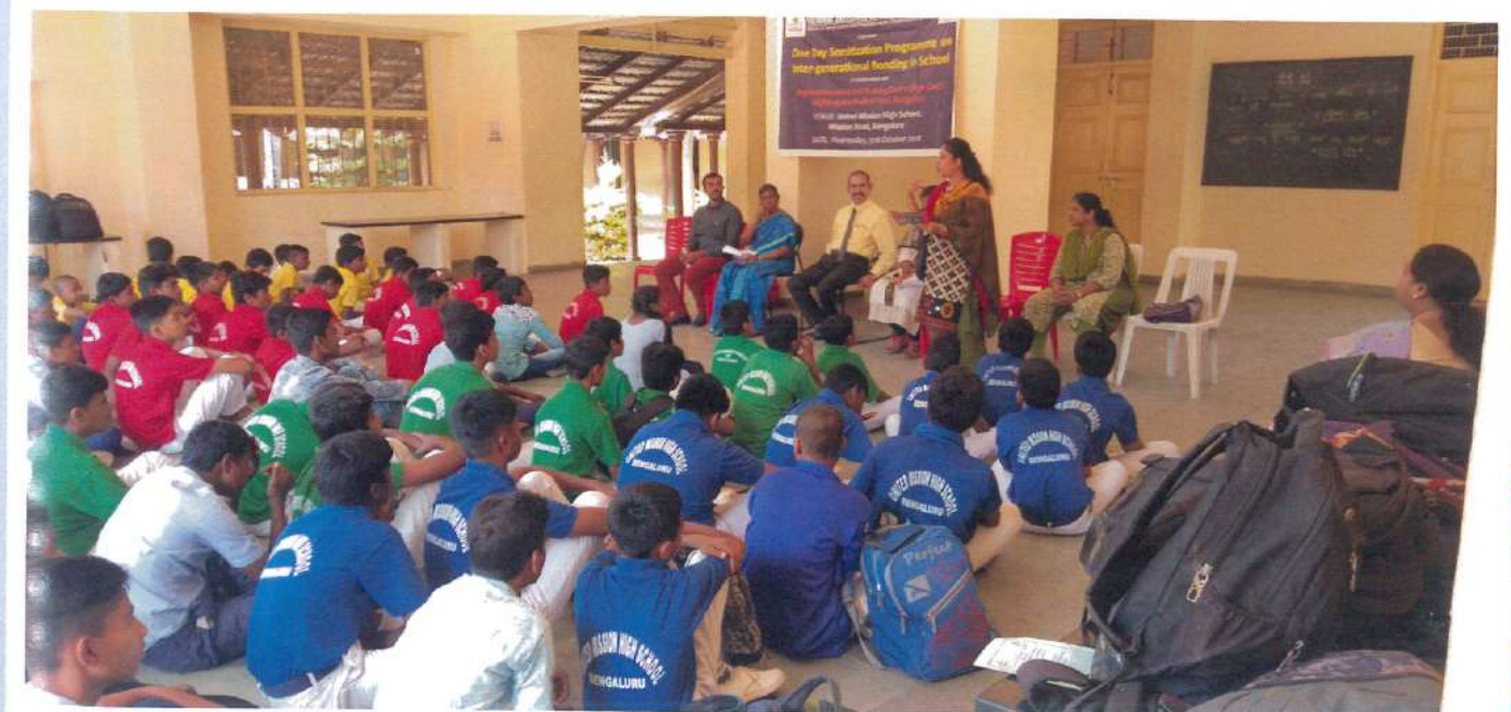
One Day Sensitization Programme on Intergenerational Bonding at United Mission High School, Bangalore organized by Nightingales Medical Trust on 31st October, 2018

other Collaborating Agencies organized the programme including Technical sessions on elderly issues, MWPS Act, 2007, generational gap, Group discussion, painting competitions on the theme of generational gap.