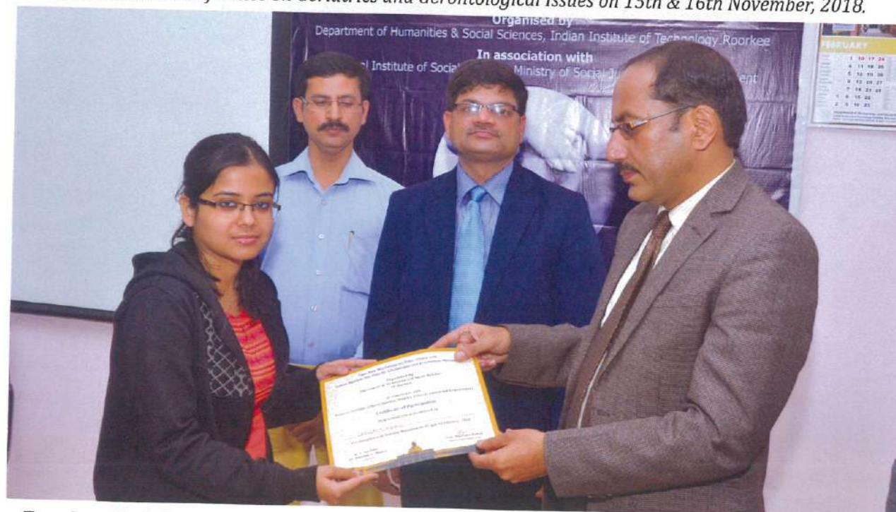
Two days Workshop on Elder Abuse and Crime Against the Elderly in collaboration with IIT, Roorkee