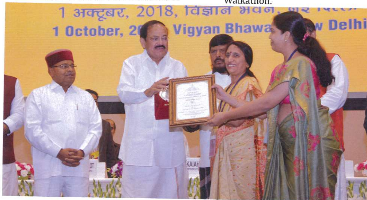
Shri. Muppavarapu Venkaiah Naidu, Hon'ble Vice President of India along with Shri. Thawar Chand Gehlot, Union Minister of Social Justice and Empowerment giving away the National Awards on Observance of "The International Day of Older Persons" on 1st October, 2018.

Awards were conferred on the eminent individuals/organisations working in the field of Old Age Care by Hon'ble Vice President of India under different categories. On the same day morning Walkathon for Senior Citizens was organized at Commonwealth Games Sports Complex, New Delhi. The Hon'ble Union Minister flagged off the Walkathon.