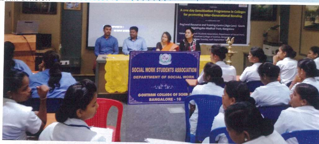
One Day Sensitization Programme on Intergenerational Bonding at Gautam College of Science, Bangalore organized by Nightingales Medical Trust on 4th September, 2018.