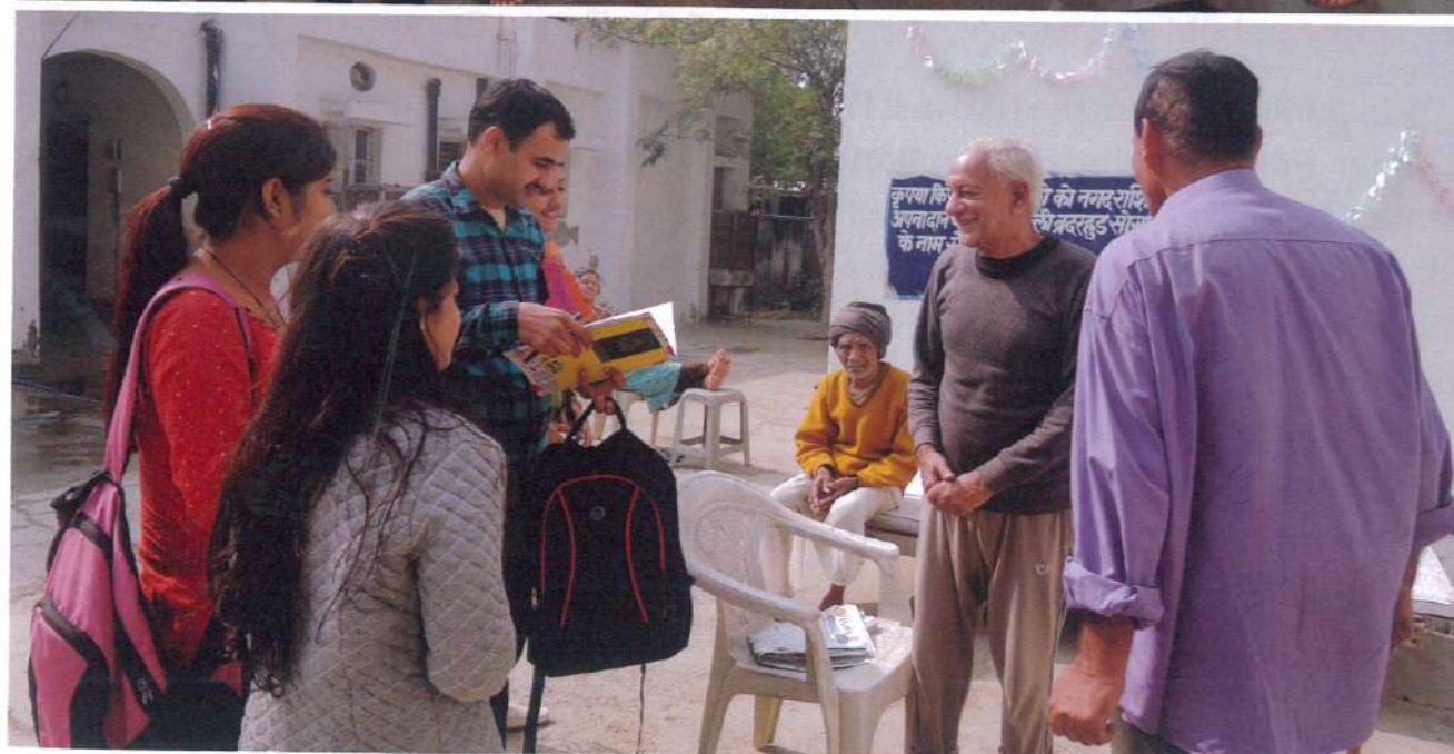
One year PG Diploma course students during field visits in Old Age Homes

with focus on programme development and management.