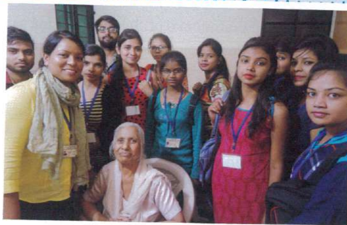
Students of Three Months Certificate Course on Geriatric Care during field visit/On-Job Training